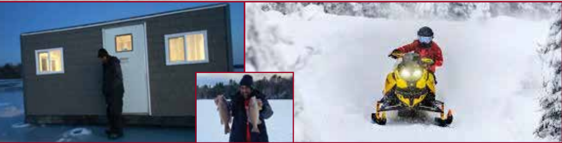
Ice Shanty Rentals Available

Test your skills in the call of the wild... When Fall rolls around, we welcome the musky fisherman, hunters and all who enjoy the fall colors. Our area offers whitetail deer, bear, turkey, grouse, woodcock, duck, geese and all other small game hunting seasons. There are thousands of acres of public land in our area at your disposal.